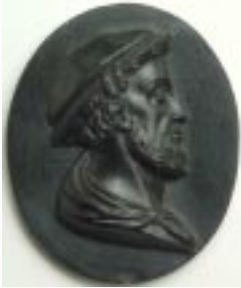
King Henry VIII, Wedgwood

iA painting technique using only black, white and shades of gray