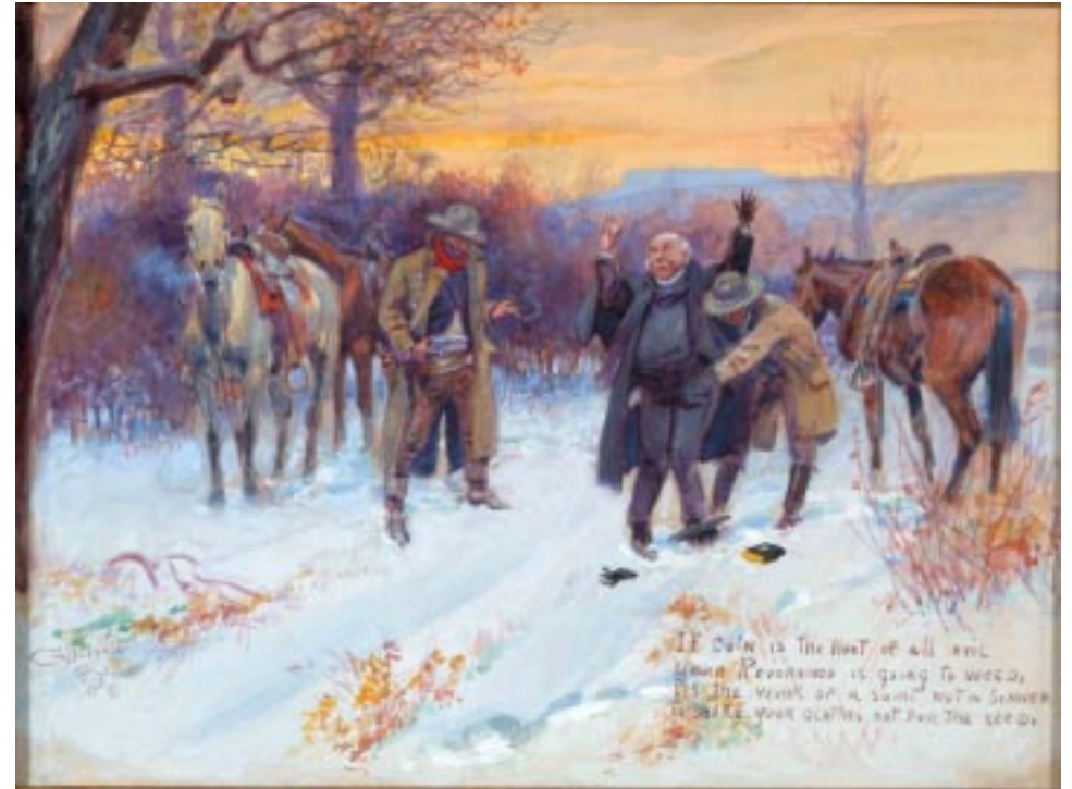
Fleeing the Preacher , Charles Russell

If coin is the root of all evil Your Reverence is going to weed, It's the work of a saint, not a sinner To shake your clothes out for the seed.