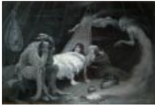
Death of Minnehaha, Frederick Remington