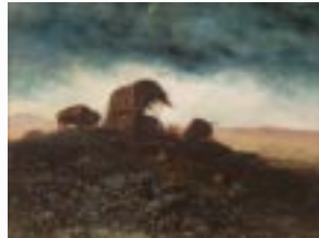
Trail of Yesterday, A.D.M. Cooper

Basalt A volcanic rock that often has a glassy appearance.