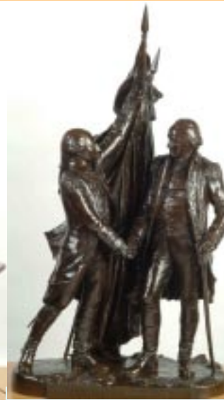
Washington and Lafayette, Batholdi