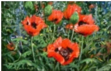
Poppies, Peter Ellenshaw

Complementary Colors are opposite each other on the color wheel and create contrast and balance .